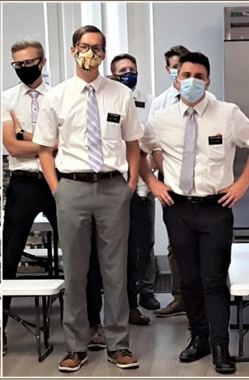
Elders of the Church of Jesus Christ of Latter-day Saints