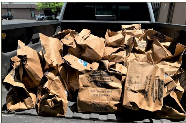
Prepackaged bags of food donated to the pantry by Grocery Outlet