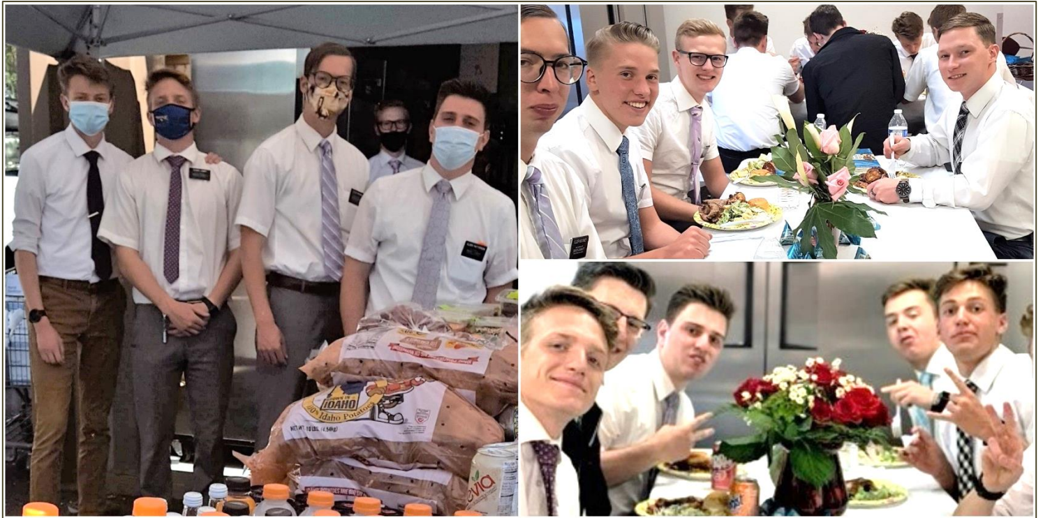
Elders from the Church of Jesus Christ of Latter-day Saints