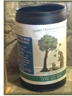
Our food barrels are used to collect donations for the pantry.