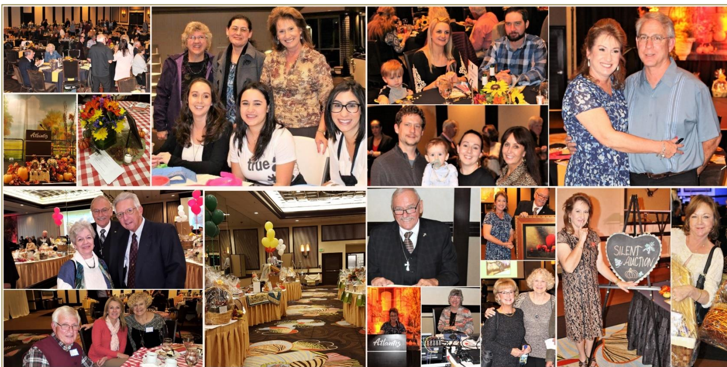
Spaghetti Dinner at the Atlantis 2017 and earlier