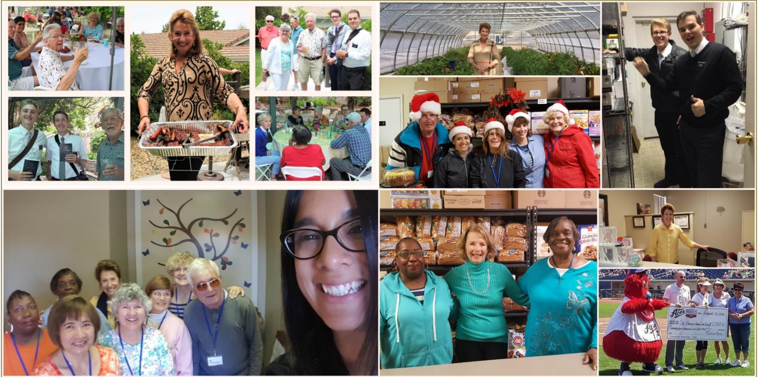
Lower left: Volunteers on Opening Day 4.6.16

Below is a small sample of some of the fun and meaningful moments from the past 5 years, focusing primarily on our wonderful volunteers who make the pantry possible by sharing their time and enthusiasm. It has been an outstanding journey and we aren't done yet! Here's to many more years of serving our community and having fun while doing it!