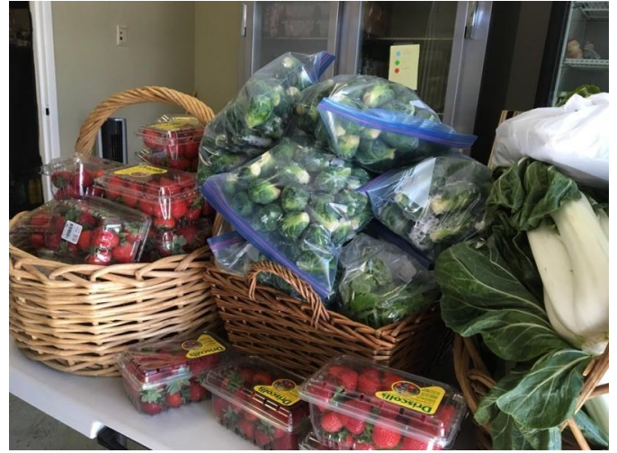
Just a few of the healthy fresh foods available at the pantry!