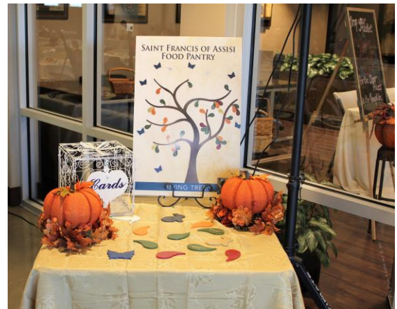
Our Giving Tree is growing thanks to our generous supporters!