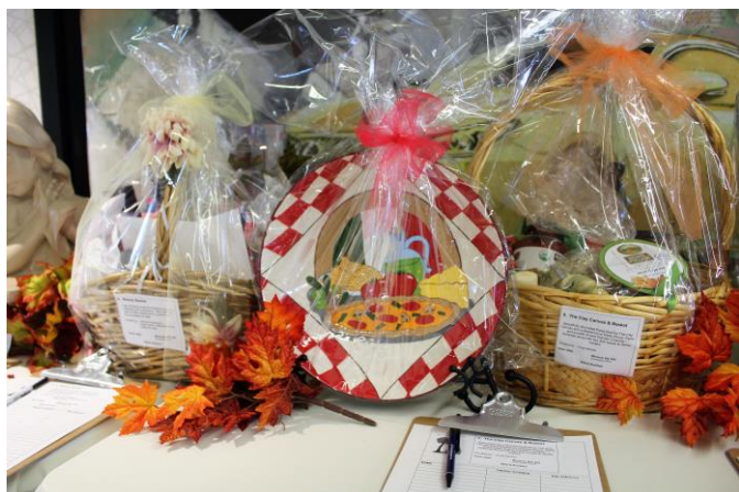
Some of the Silent Auction items, including a colorful, custom pasta bowl made just for us!

Together we raised over $27,000 at Spaghetti Night and these funds will allow us to continue on our mission of providing healthy fresh food to our clients at no cost to them. The need continues to grow in our community and is reflected in the increasing number of clients we serve from month to month.