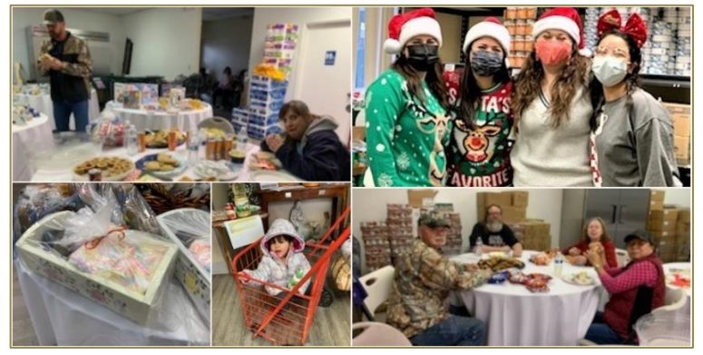
Christmas Luncheon for pantry volunteers Upper right – volunteers from White's Creek Dental

Gift cards donated by the Bishop Manogue Sodality Club; turkeys donated by Sierra Meats and Western Nevada Supply.