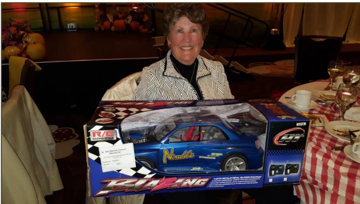
One of our happy Raffle winners!