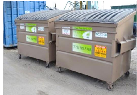
Green Solutions Recycling dumpsters

We have been seeking a low-cost way to recycle the large amount of cardboard we generate each week, and are thrilled that Green Solutions Recycling in Reno has offered to pick it up every week at no cost to us! We couldn't be more pleased and grateful for their generous assistance in keeping the pantry green on the inside and the outside too!