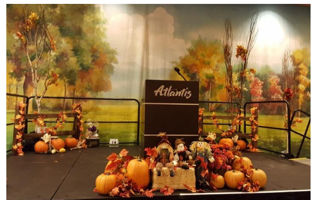
The stage in the Ballroom at the Atlantis Casino Resort Spa