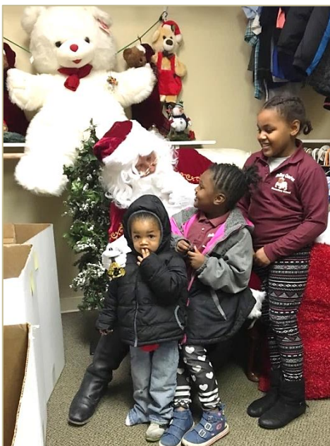
Santa with a few of his delighted admirers