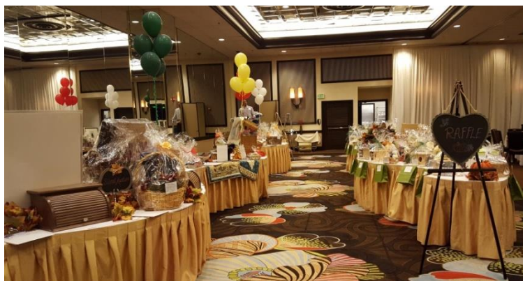
Silent Auction and Raffle Item tables