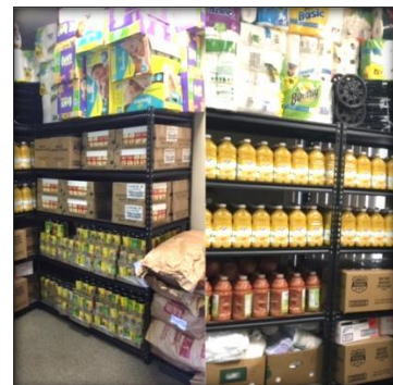
Just some of the non-perishable commodities we receive

We are happy to report that we have been selected as one of only a few pantries in our area to participate in bulk receipt of items from The Emergency Food Assistance Program (TEFAP), also known as Commodities, sponsored by the US Dept. of Agriculture. This federal program helps supplement the diets of low-income Americans by providing them with emergency food and nutrition assistance at no cost to them or to the pantry. Foods provided vary each time, but generally include a mix of canned fruits and vegetables, fresh eggs, meat, poultry, fish, milk, cheese, pasta products, and cereal. Our clients couldn't be more thrilled to have this extra bounty of food and we are thrilled to be able to offer it to them!